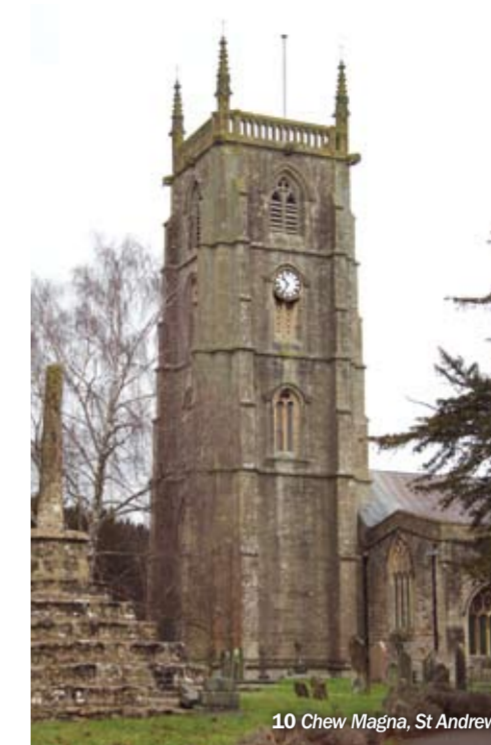
10 Chew Magna, St Andrew

A wonderful survival, examples of wall painting matching the church's history, untouched country furnishings including two galleries. Opening Times: Daily from mid-April during daylight hours. Directions: Ten miles NE of Wells, off the A37, along Cameley Road. Postcode: BS39 5AH