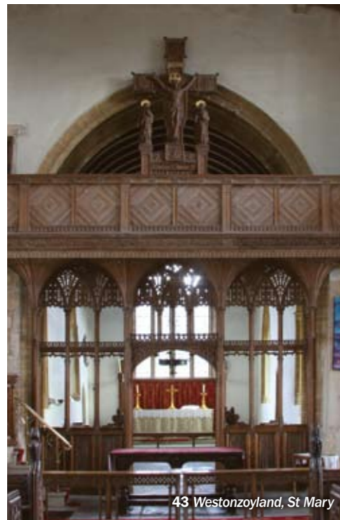
43 Westonzoyland, St Mary

for through a lawyer's bequest. Ingenious rooms added 2004. Kempe glass. Opening Times: 10 am – 4 pm daily. Directions: In the centre of the town at the junction of Friday Street, The Avenue and Park Street in Wellington Square. Postcode: TA24 5LJ