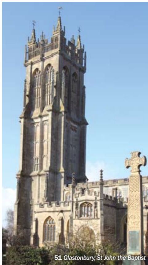
51 Glastonbury, St John the Baptist