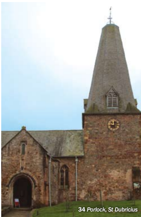
34 Porlock, St Dubricius

Impressive if unusual work of G E Street for expanding Victorian seaside resort, paid