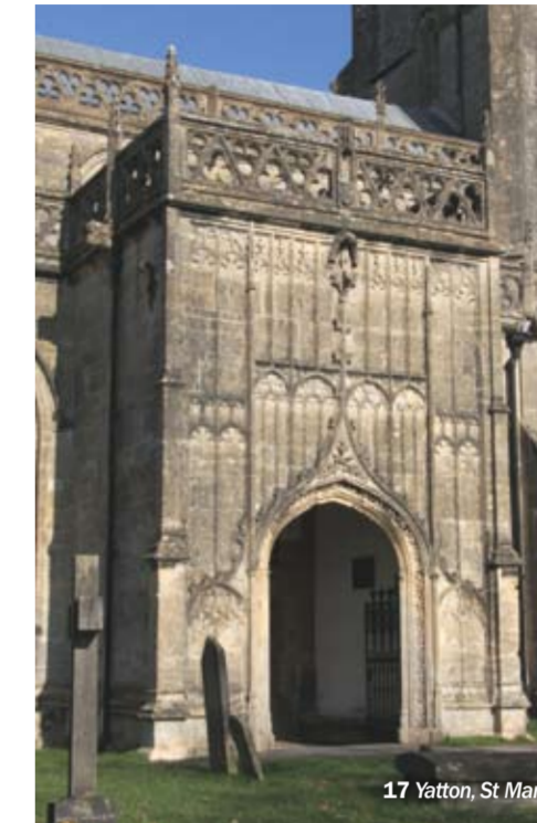
17 Yatton, St Mary

Norman columns remind visitors of Durham; but would they notice that the chancel roof was once used as a pigeon loft? Opening Times: Dawn to dusk. Directions: Above the A368, opposite the duck pond. Postcode: BS40 6JQ