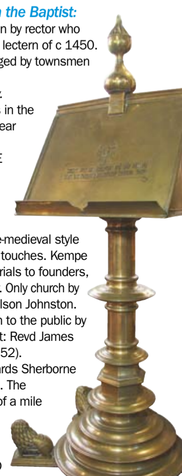
67 Yeovil, St John the Baptist