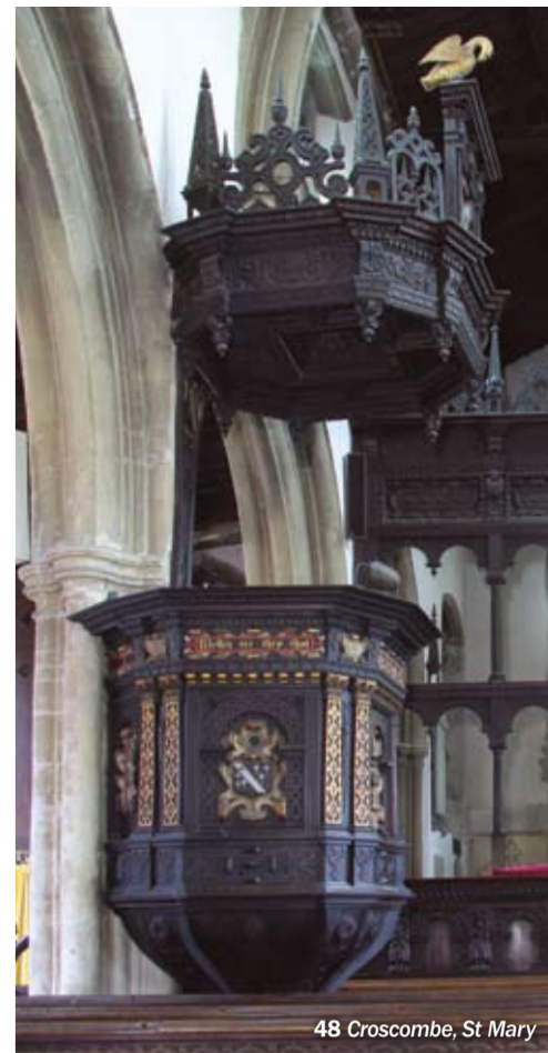
48 Croscombe, St Mary

Large, probably by Wells cathedral masons c 1300, the Perpendicular. St Christopher painted above 17th century pulpit. Opening Times: From around 9.00 am – 6.00 pm daily. Directions: Top of Church Street and overlooks the centre of Wedmore. Postcode: BS28 4AB