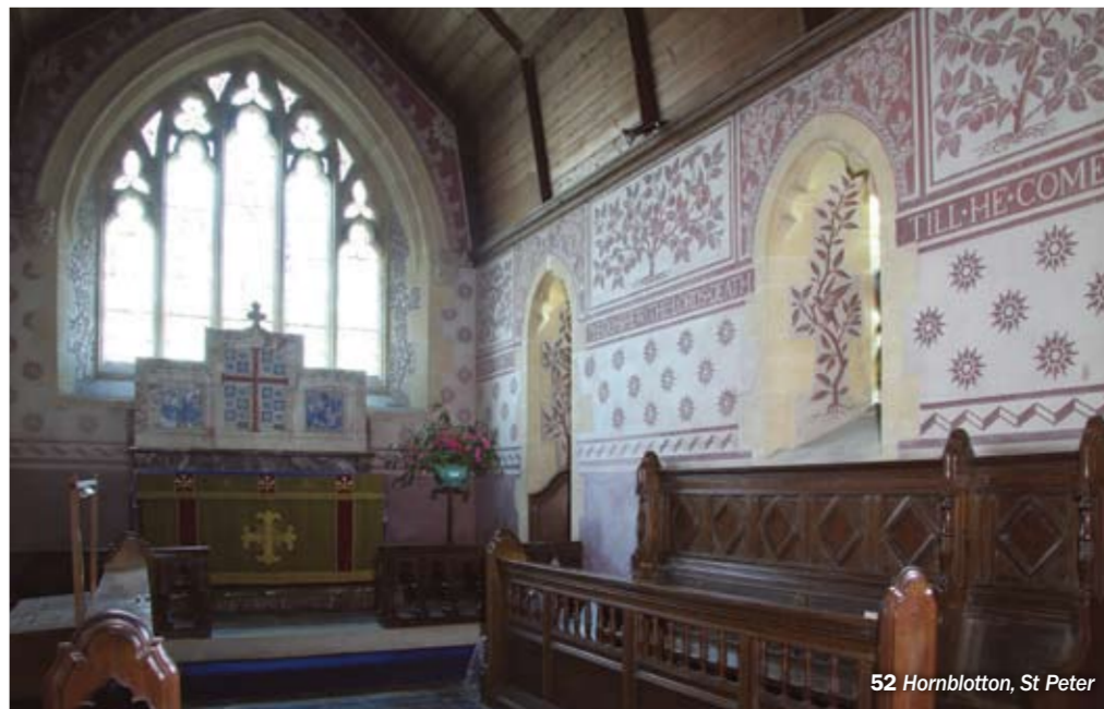
52 Hornblotton, St Peter