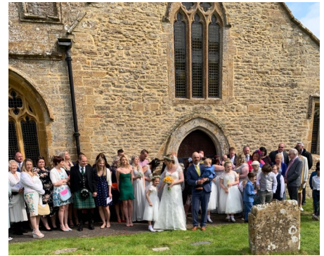
One of our wedding parties

The church has supported a great deal of expenditure on fabric during the last two years and as a result the Diocese has agreed to a reduction in our parish share for this year and next. Fund raisers work tirelessly to achieve this financial support by running a variety of social events