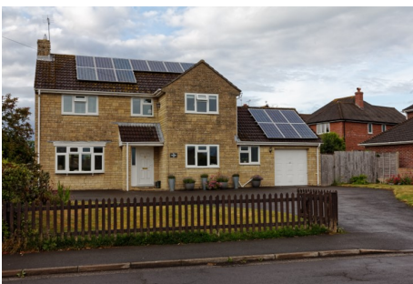
Clockwise from top left: a Baptism at Holy Trinity, the historic interior of St Mary Magdalene and the vicarage.