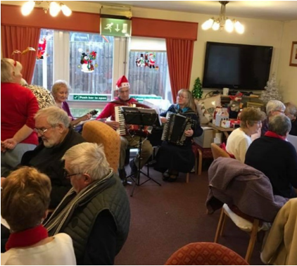
A social event at Whitcross

This is also part of our outreach into the local community because there are many people from the villages who enjoy attending these events, but at present rarely come to church services. People still consider the church and activities associated with it as a central facility and part of village life and we feel it is important that we are seen to be fulfilling that role in our outreach.