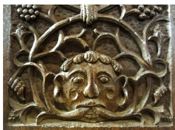
An example of the Jacobean carvings

Building The earliest part of the church building is about 800 years old but it has evolved over the years and is still considered to be an important part of village life. The carved pew ends are a particular feature. There are those who attend the church and others in the village, who love the building and are prepared to care for it. We have a Heritage committee and an on-going Fabric Fund to that end. Extensive repairs to the roof have recently been carried out.