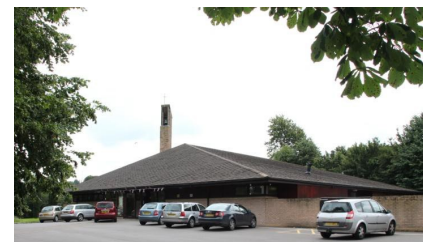
Holy Trinity site