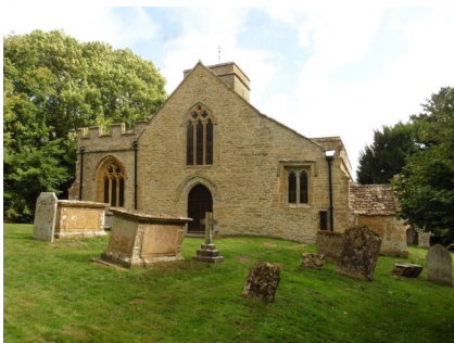
St Mary Magdalene

Our church family serves in many wonderful and varied ways across the benefice and the wider community. We are one united benefice with two churches, sharing and encouraging one another in the service and proclamation of God's Kingdom. We are a family of believers who are not perfect, who invariably make mistakes, and who get things wrong, but who seek to follow Jesus and to serve as disciples of Jesus, knowing that the grace of God welcomes us and that the love of God has the power to transform us all.