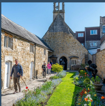
St Margaret's Chapel

This has given us a guide as to how we may further develop the opportunities identified and can look towards our PCCs to plan while maintaining our strengths, address our weaknesses and pray for guidance to turn the perceived threats into opportunities. We would like to draw your attention to the SWOT analysis (Your Views Matter) which can be found on St John's website and appended to the end of this document.