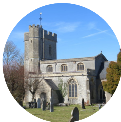
St Mary's, Meare