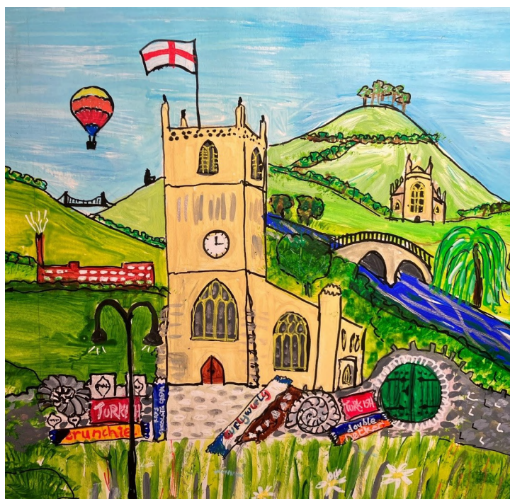
An Artist's View of Keynsham