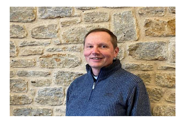
Archdeacon of Taunton