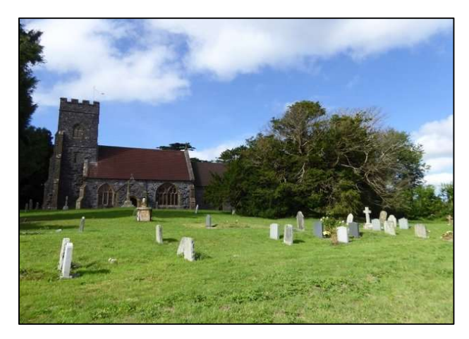
Location: TA21 0LF

The village takes its name from ash trees and Bretel de St Clair, the Norman lord in 1086. It is a hilltop village of scattered 16<sup>th</sup> and 17<sup>th</sup> century farms with a community set around a village green, an unusual feature in this area.