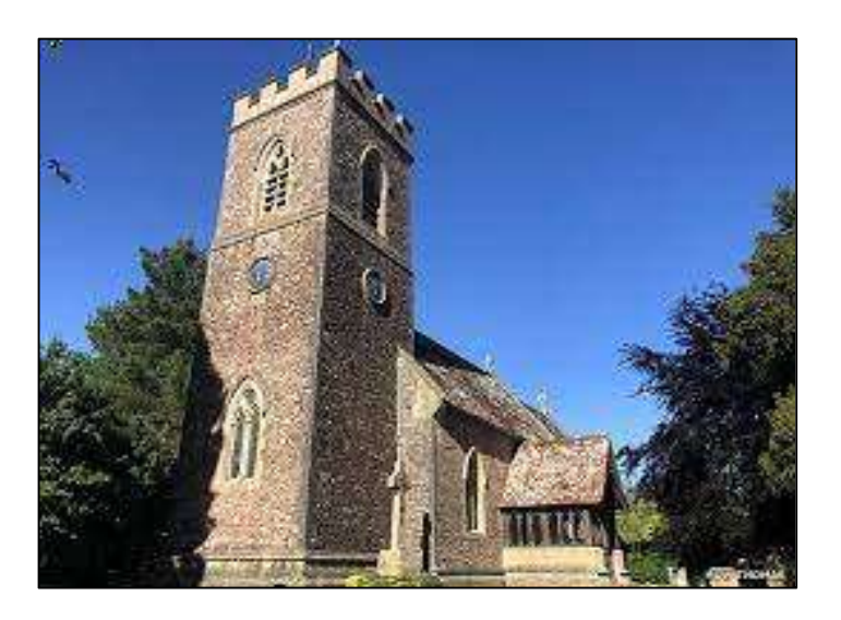
Location: TA4 2AN

Bathealton village is hidden by wooded hills and lies in a valley to the west of Wellington. The village was given to William de Mohun of Dunster Castle following the Norman Conquest. Later it was divided into three and then re-united under the Webber family, passing finally to the Moysey family in 1845. There are some listed buildings within the village.