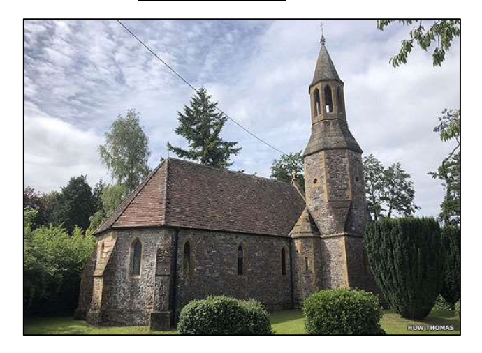
Location: TA21 0JJ

St Peter's Church, Greenham has an idyllic setting in a peaceful hamlet close to Wellington. The church was built as a chapel of ease in 1865 to save a long, uphill walk to Ashbrittle. Mindful of the fact that the church was outside Faculty Jurisdiction but required Listed Building consent from the LPA, the churchwardens decided that the Bishop should be petitioned for the building to be consecrated. The river runs around the church site. Built in 1860 by Henry Davis to a design by C.E. Giles. The roof looks like an upturned boat. An unusual feature is a modern (2008) Royal Arms commemorating a former churchwarden. There is an elegant "candle snuffer" spire mounted on the octagonal NW tower. A monument to Admiral Kelly has lettering by Eric Gill, who also produced two